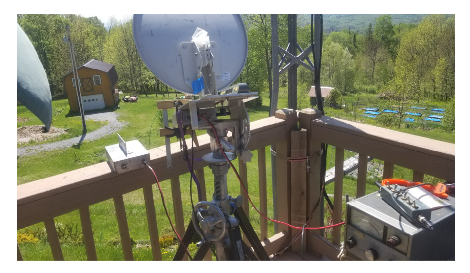
Figure 6 – Slant antenna range for testing tilt alignment on the two bands

Peaking the dish for this test requires high resolution of signal strength, to fractions of a dB - a tiny S-meter won't do. I use the sun noise meter at the lower right in the photo, which displays a range of 5 dB on the large meter from a defunct HP power meter. Once it is peaked, I measure the elevation tilt with a digital level; the tilt is where the two bands are more likely to differ.