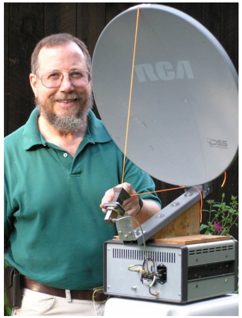
Figure 2 – Finding dish focus using string method

Most common offset dishes are designed so that the bottom of the dish is level with the focus when pointed at the horizon, as shown in Figure 1. The dish focal length f can be calculated using the HDL_ANT2_WinForms<sup>1</sup> program (thanks to W3SZ). I recommend using the string method to locate the focus in space – the program will calculate string lengths, from the top and bottom rim to the focus. Some of the available offset dishes are tabulated at <u>http://wlghz.org/antbook/app-5a.pdf</u>