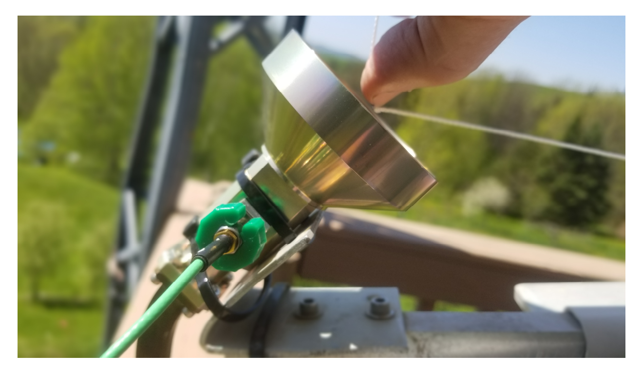
Figure 5 – Using modified string lengths to align feed at center of aperture