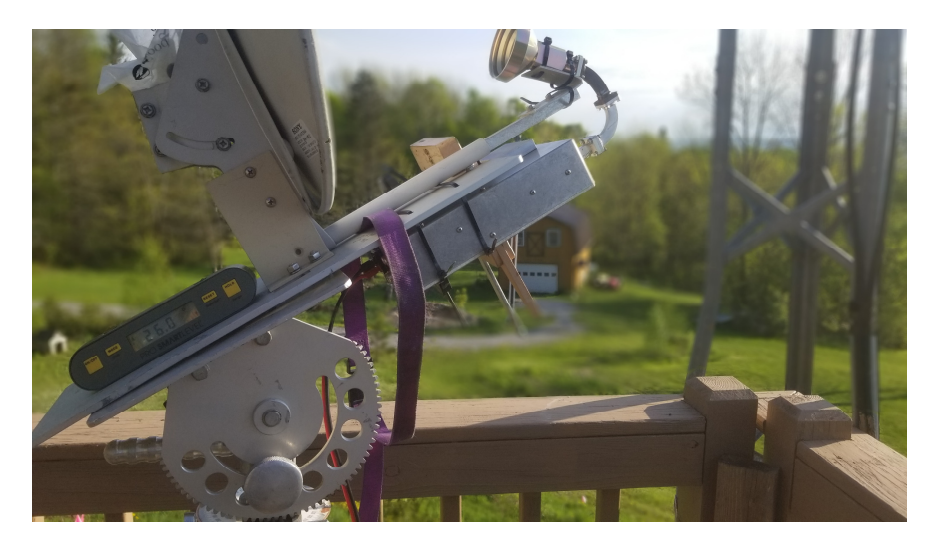
Figure 7 – Measuring sun noise and calibrating elevation tilt

Sun noise may also be measured with with a computer, if you don't have a dedicated sun noise meter. Bob Atkins, KA1GT, has a good description<sup>4</sup> using WSJT-X or Spectravue software for sun noise measurement.