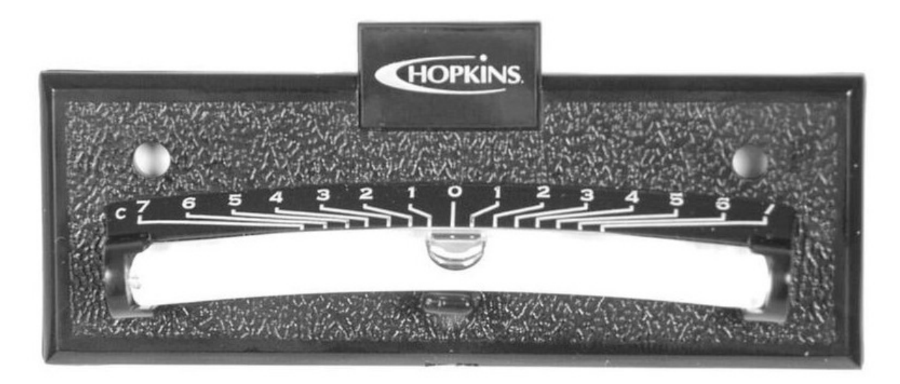
Figure 3 – Simple RV tilt indicator for quick elevation alignment of offset dish

The 24 GHz port may be covered, or left open for water to drain out. 10 GHz energy will not propagate through the 24 GHz waveguide.