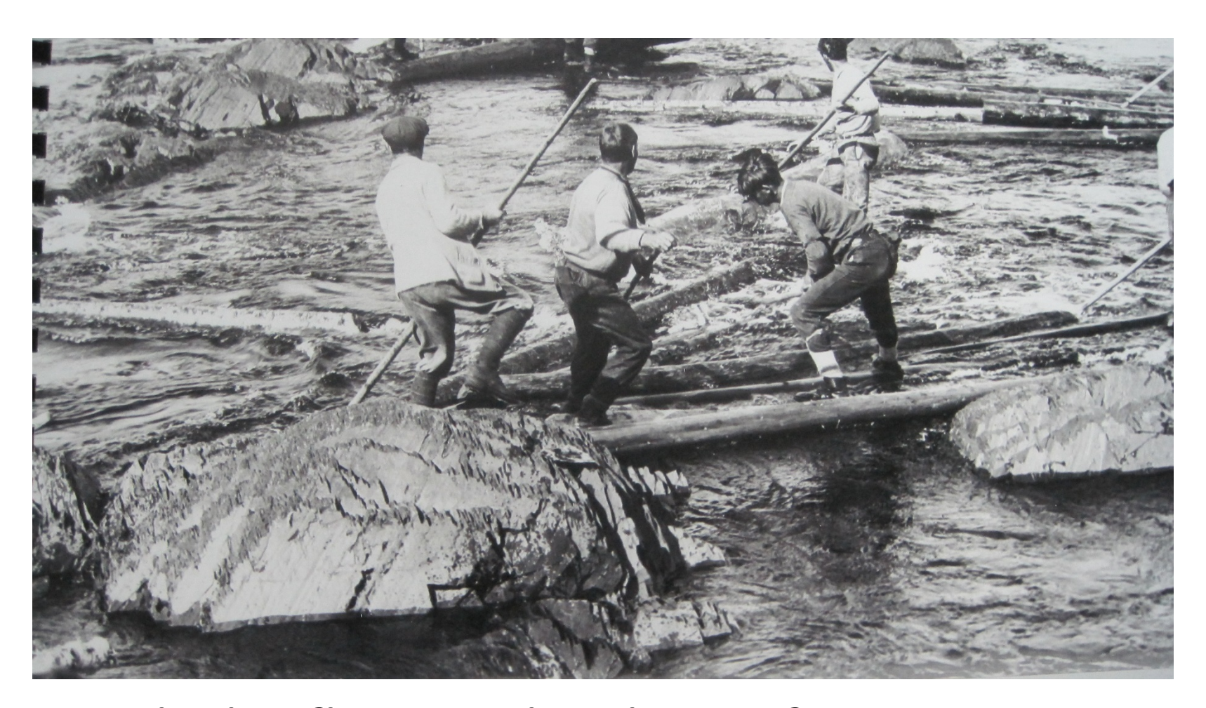
Go with the flow... Thank you for participating!