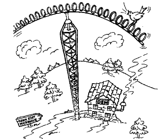
Sav vou saw it in the NEWSTetter

MICROWAVE LOOP YAGIS, VHF/UHF YAGIS, NO-TUNE LINEAR TRANSVERTERS, LINEAR POWER AMPLIFIERS, LOW NOISE PREAMPS, COAX RELAYS, COAX CABLE, CONNECTORS, CRYSTALS, CHIP COMPONENTS, MMIC'S, TRANSISTORS, RF MODULES