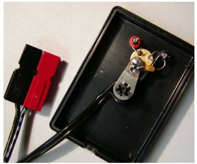
untrustworthy digital meters.

A few nights later, I found a bag of parts buried on the workbench — probably purchases from a hamfest last summer. Among the gems was an IC marked AD581L. A quick search at www.analog.com showed it to be a precision voltage reference, laser-trimmed to exactly 10 volts. Just the ticket for