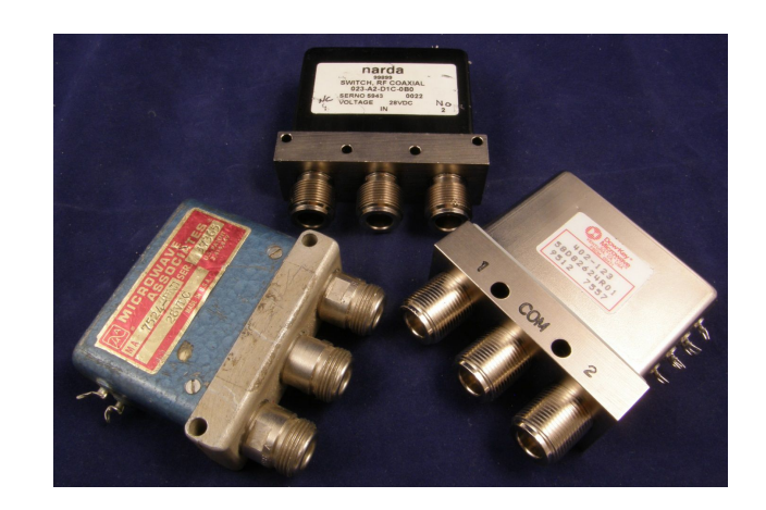
Figure 2 – Coax relays with good isolation at 1296 MHz

I quickly dug through my coax relay collection and started measuring isolation. All the relays like Figure 1 were in the 40 dB range, but several like Figure 2 had 60+ dB isolation. They don't look easy to rewind for 12 Volts, but my amplifier runs on 28 Volts anyway. They also take a fair amount of current to switch, 250 to 300 mA at 28 Volts, so the booster is not an option. The one on the right is a latching relay; that's a separate problem.