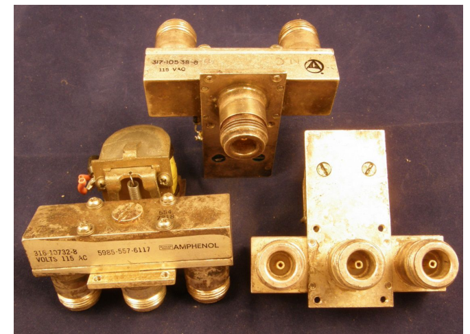
Figure 1 – Coax relays with marginal isolation at 1296 MHz

Another solution is to rewind a 28 volt relay to operate on 12 Volts. I've done this for several relays with Type N connectors, and used one for years on 1296 MHz. In preparation for EME operation with W1AIM, I measured the isolation of this relay – only 40 dB or so. So I've been hitting my preamp pretty hard for a long time! Time for a new relay.