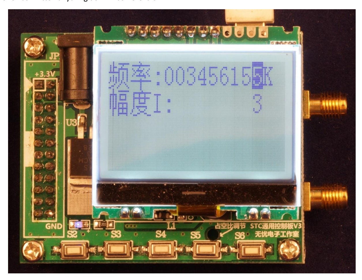
Figure 1 - Inexpensive ADF4350 signal source from China

A very useful signal source for VHF thru microwaves can be found on eBay. These inexpensive synthesizers cover 137 MHz through 4.4 GHz, with strong harmonics up to at least 24 GHz, generated by an ADF4350 chip. A unit is shown in Figure 1. The frequency is easily set with pushbuttons if you know how, but there are no instructions. Don, W1FKF, figured them out and told me, but to my knowledge no one has written anything down – so here it is.