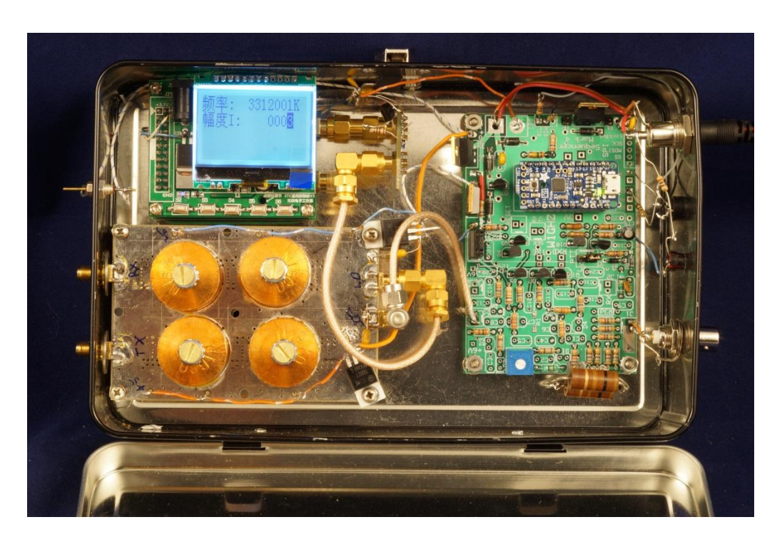
Figure 3 – Signal source as LO in simple transverter

The units are reasonably stable and clean, good enough to be the LO for a simple transverter like the 3456-MHz lunchbox transverter shown in Figure 3. The synthesizer output is about 1 dBm at the highest setting, so a small MMIC amplifier is needed. Since it has a cheap crystal, the frequency isn't exact, but easily compensated with the pushbuttons.