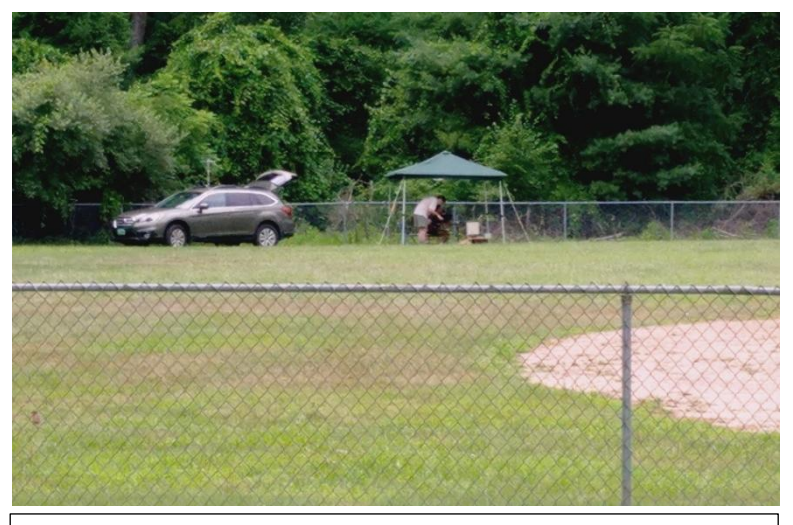
Signal source location – approximately 320 feet away

MDS (Minimum Discernable Signal) and ERP testing on 10 GHz, 24 GHz, 47 GHz. and 78 GHz: To test for MDS, we set up a distant signal source. After everyone has a chance to peak up on the signal, the signal level is reduced one dB at a time. At the point when you can no longer hear it, you have found the MDS for your system. You decide how well it works, and whether you can hear as well as Don and Dale.