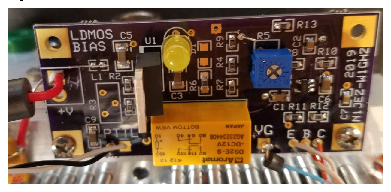
Figure 2 - LDMOS Bias Board Prototype mounted on amplifier

Figure 2 shows a prototype PC board mounted on an amplifier. Construction might be more elegant if it weren't an add-on.