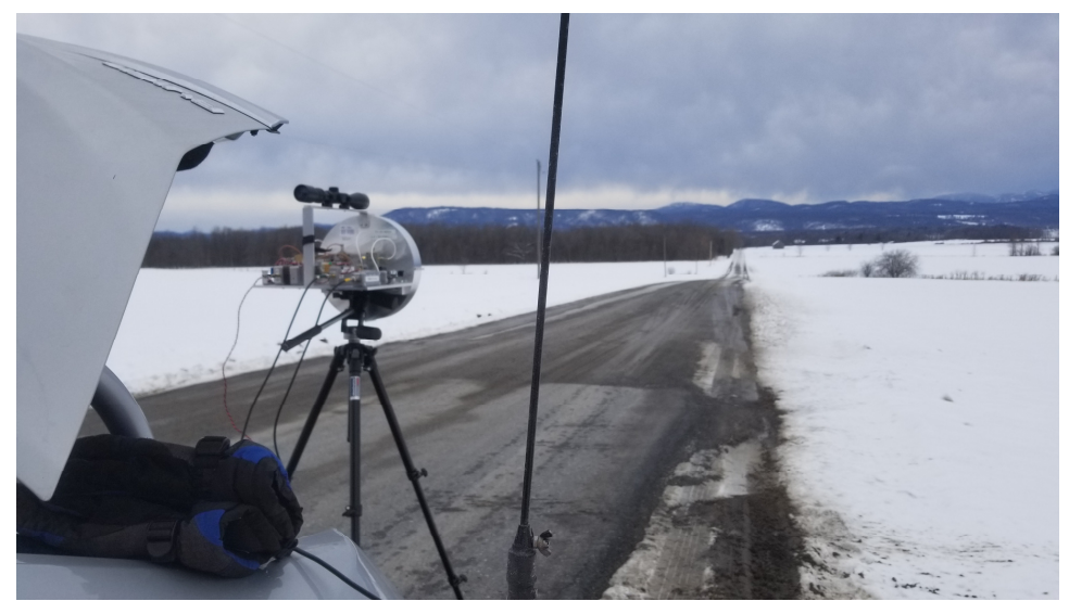
241GHz set up