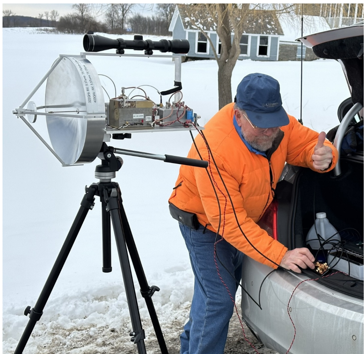
WIGHZ gives the "thumbs up QSL" to the camera while completing a QSO with NIJEZ on 241GHz

While we had very good success on Wednesday, this was preceded by dismal failure only a few days before. On the previous Saturday, we set up 134 GHz and could not get one rig to lock. The temps and wind were producing wind chill in the negative numbers. We struggled to get the gear working in the cold, but threw in the towel after many hours of trying. We were all chilled to the bone.