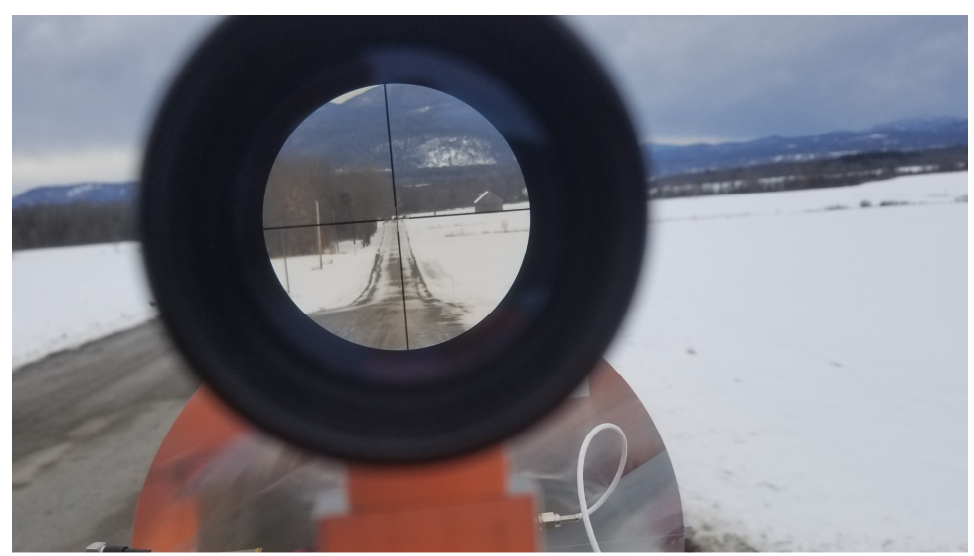
Through the Rifle Scope looking towards N1JEZ on 241GHz