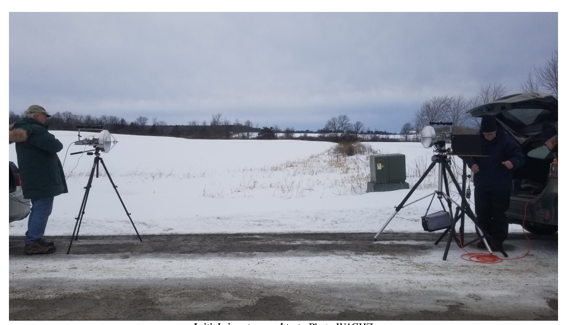
Initial rig set up and test

We tried 134 GHz first. We set up the rigs about 15' apart to verify operation.