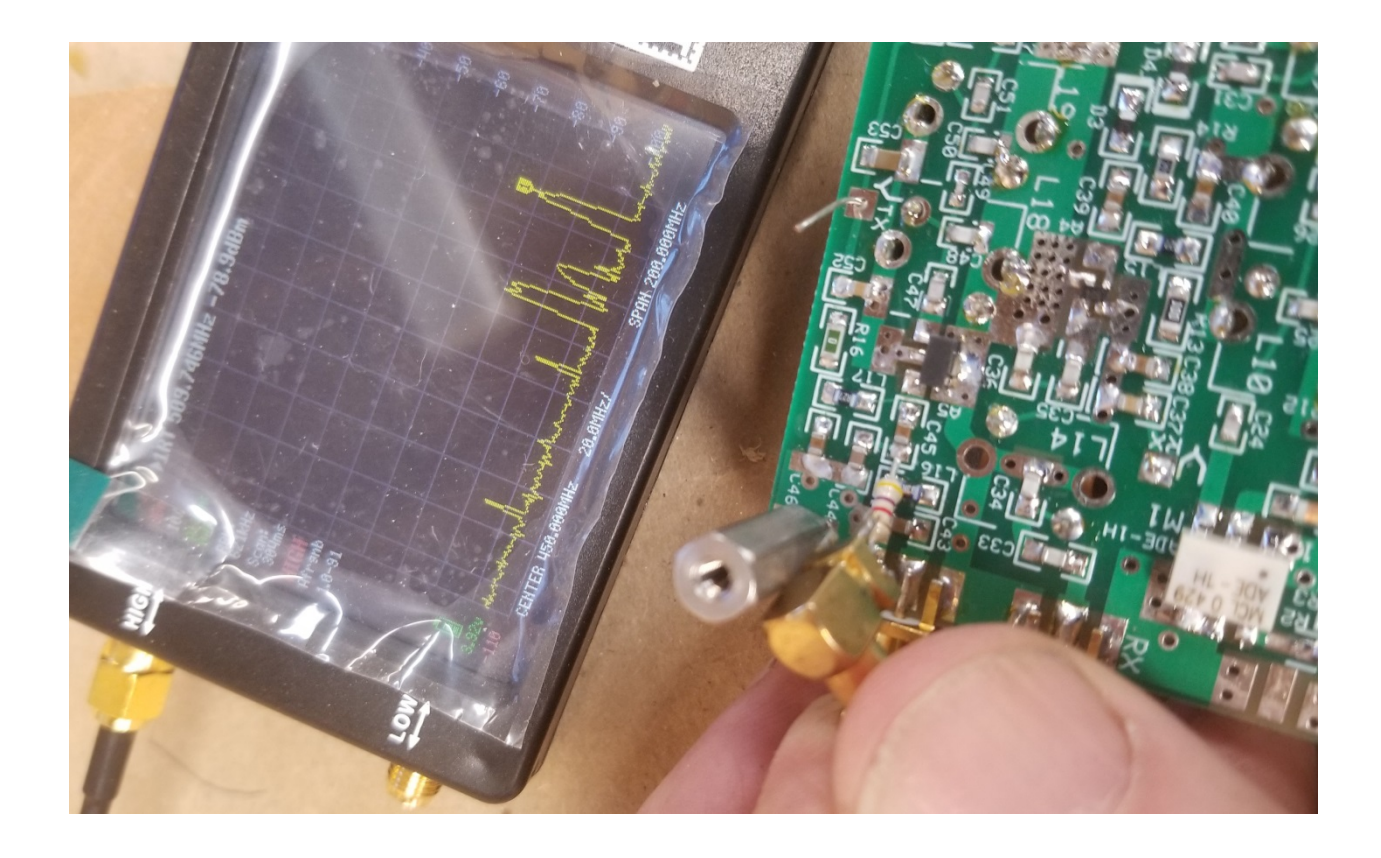
Figure 1 – Probing RF circuit with Spectrum Analyzer thru isolating resistor

The failed front-end MMIC was a Minicircuits PSA4-5043. I replaced it with a PGA-103, which is slightly larger and draws more current, but still has a low noise figure; I thought it might be more robust than the one that failed.