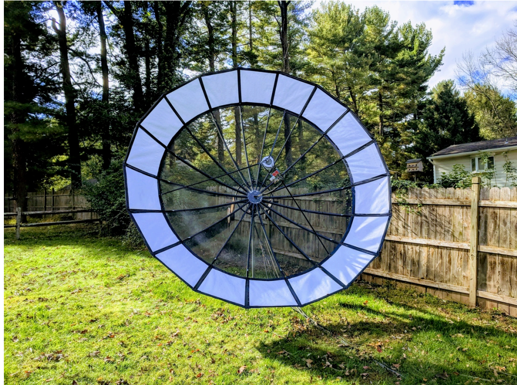
Completed 4m dish with completed stress extension.

The dish survived the FN20 winter of 2019 with no problems.