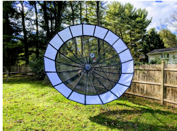
4m Dish (extended)