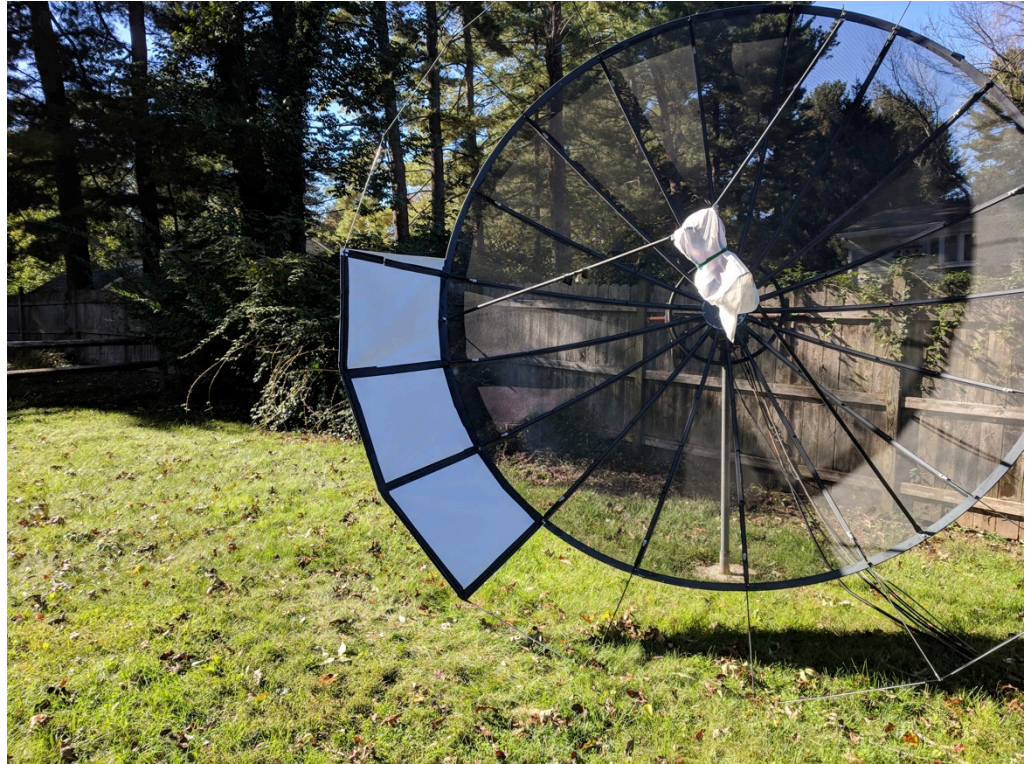
3m dish with 4m framework – partial Mylar covering.

I installed all 18 panels in about six hours.