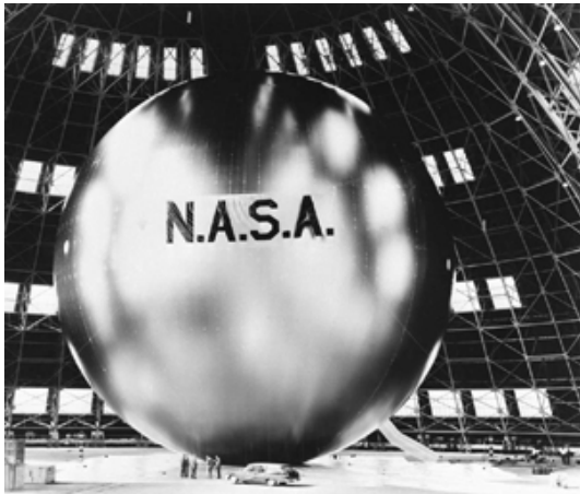
NASA ECHO-1 Passive-reflector Satellite