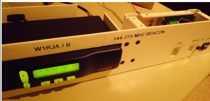
New W1RJA 144.275 FN41CU 20 Watt beacon