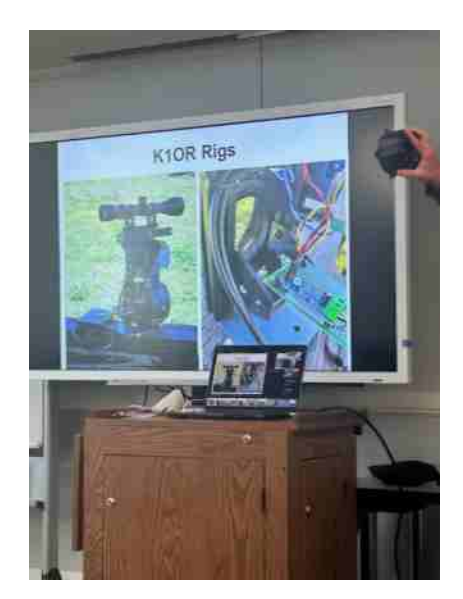
ar M ti