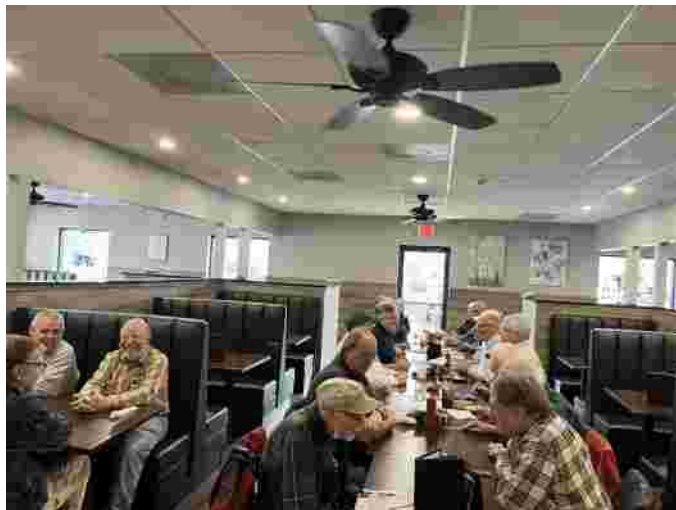
Lunch 11-22-25 (21)